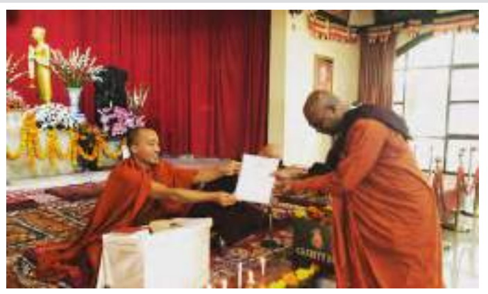
Awarding Diploma certificate to student.

• There is much demand from the Dhamma aspiranrts from different counters to conduct virtial three months Vassa program similarly like thi year in the forthcoming year For the benefit of the truth seekers. Therefore, as per the request of our devotees once again a comprehensive course on different dimension is to be designed in the forthcoming year.