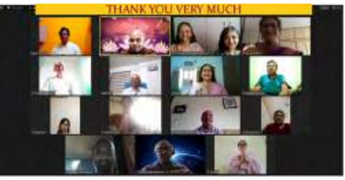
MBRC Student celebrating Vesaka Buddha purnima online.

Every year we celebrate the BUDDHA JAYANTI (The Birth, Enlightenment, and Mahaparinibbana of Supreme Buddha) by coming together at Vihara. But this year however due to the 2nd wave of Covid-19 and Govt. Guidelines we have restricted our upasakas and upasikas by participating through online. On occasion of 2565th Vesaka Buddha Purnima Mahabodhi Research Centre has conducted a one day seminar topic on "The Life and Teachings of Buddha". In this webinar our Mahabodhi Research Centre students presented their paper on different topics.