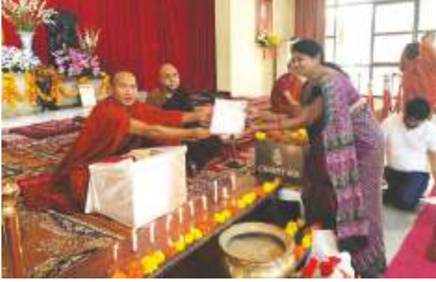
Awarding Diploma certificates to MBRC student

14 students have attended the exam and out of 14 candidates 9 students have cleared the annual exam successfully conducted by the Karnataka Sanskrit University.. After completing the course, students of Research Centre will be eligible for higher Buddhist studies.