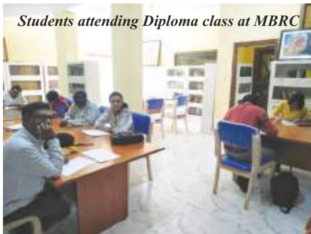
Students attending Diploma class at MBRC