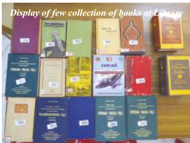
Display of few collection of books at Library

The Mahabodhi Library has been revamped and redesigned with new furniture, study tables, chairs and racks. The library is unique in the sense that it hosts the valuable Sacred Tipitaka both in Pali and English translation. More than 10,000 titles in different languages are in the library for the readers. Every month new arrivals - magazines, journals, and periodicals are added to the storehouse of knowledge in the library. For research scholars and monks, the library is used for referencing and preparing projects. Positive ideas and initiatives are taken up to increase library membership and wide accessibility to public readers. Besides this, we have planned to make Digital library section to reach out to maximum number of readers. In this regard, we request one and all to come forward to take the membership of our library and also spread the word so that maximum number of persons can be benefitted.