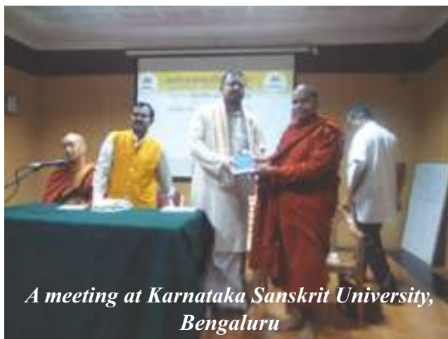
A meeting at Karnataka Sanskrit University, Bengaluru

Mahabodhi Research Center, started in the year 2017, affiliated with esteemed Karnataka Sanskrit University, Bengaluru, to run different Buddhist courses.