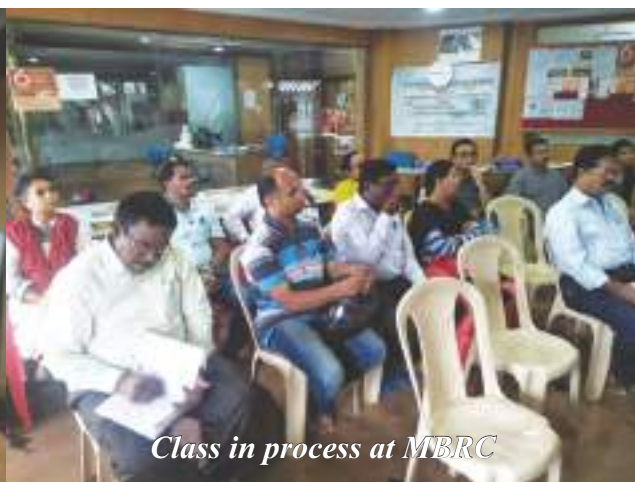
Class in process at MBRC