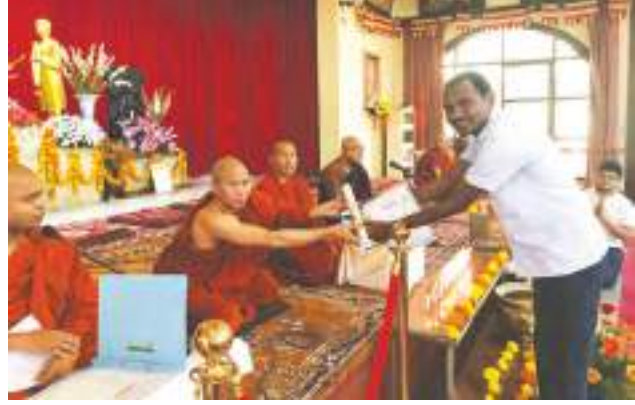
Presenting Diploma certificates to MBRC student